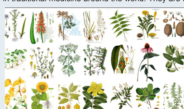
Figure 1: Figures of most important medicinal plants and their properties with a known or proven effect on wound healing.

In the Figure 1 are presented herbs that have proven effects on the wound healing and are used as wound healing agents in traditional medicine around the world. They are more precisely described in our review article.