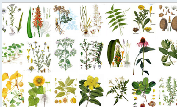
Figure 1: Figures of most important medicinal plants and their properties with a known or proven effect on wound healing.

In the Figure 1 are presented herbs that have proven effects on the wound healing and are used as wound healing agents in traditional medicine around the world. They are more precisely described in our review article.